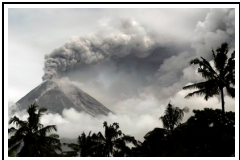
Booming new blast erupts from Indonesian volcano