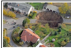
Massive crater opens up in German town