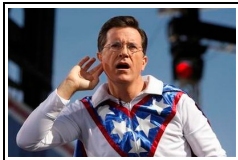
'Rally to Restore Sanity' in Washington, D.C.